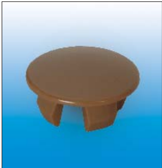
COLORED HOLE PLUG PART NO. SFHP 5006 COLOR

SEE FOREWORD SECTION FOR STOCK COLOR AND CODE